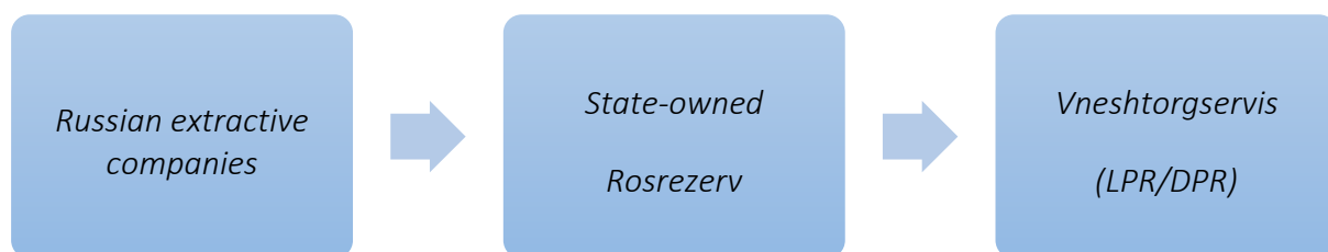
Figure 1. Russian iron-ore supply and transport scheme

In addition, Russian Railways has provided a 25% discount for transporting iron raw materials shipped to regions that are close to the LPR and DPR. According to media reports, the discount was created to support a scheme (see Figure 1) to help the DPR and LPR economies while guaranteeing that companies owned by Russian oligarchs would avoid lawsuits or sanctions. 31 Also, according to reports by Russian media, because of the amount of raw materials required for eastern Donbas companies, several other Russian firms, e.g. Metalloinvest and Severstal, were asked by the Russian government to consider supplying iron ore to Rosrezerv, a charge they denied. 32 Meanwhile, Rosrezerv received 10 bn of Russian roubles from the Russian government for the purchase of raw materials for the metallurgical industry. According to media, this replenishment of stocks was not envisaged for 2013-17. 33 In this way, the Russian Federation will supply the necessary amount of raw materials to keep 'nationalised' businesses afloat. Moreover, Russia is likely to support the sale of goods produced in the eastern Donbas.